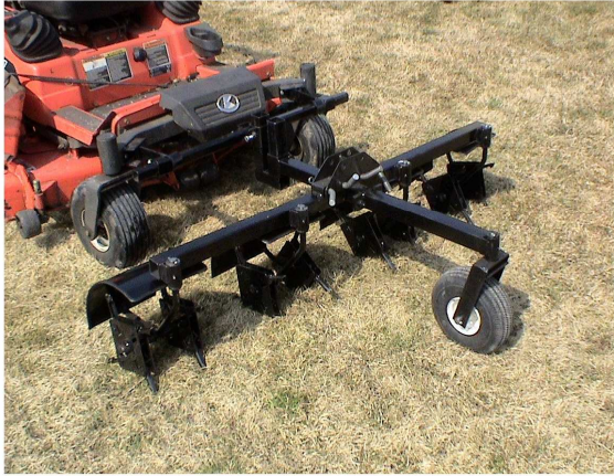
Optional Clamp-on Mount Shown